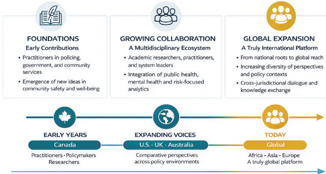
FIGURE 3 Evolution of authorship in the Journal of Community Safety and Well-Being .