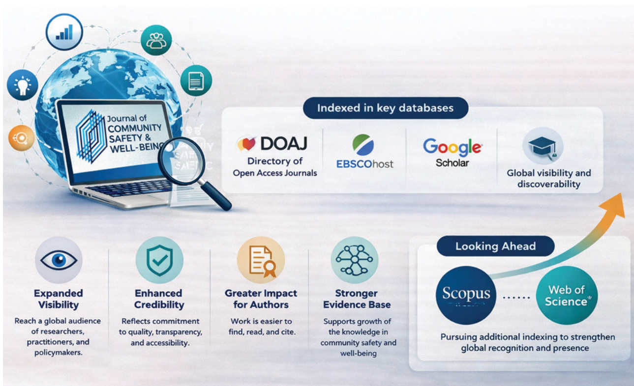
FIGURE 6 Indexing as a milestone in the evolution of the Journal of Community Safety and Well-Being .

As the Journal continues to build on this progress, indexing remains a key driver of growth, expanding visibility, strengthening credibility, and extending the reach of the work it publishes. Looking ahead, the Journal is well-positioned to pursue inclusion in additional indexing services such as Scopus and Web of Science, further strengthening its global presence and recognition (Figure 6).