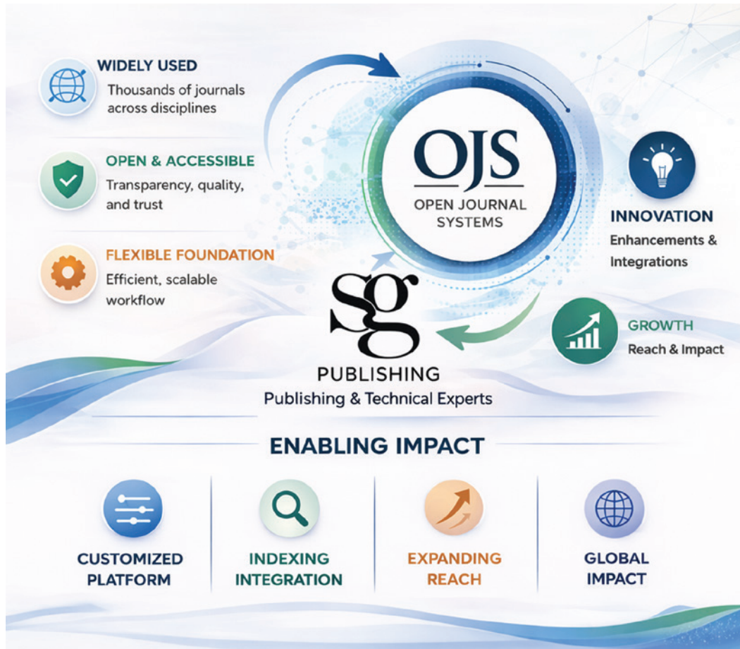
FIGURE 7 Role of Open Journal Systems (OJS) in enabling the Journal's growth and impact.